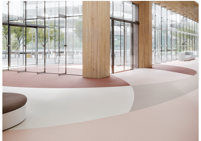
Granit Safe.T 633 Soft Brick, 571 Soft Pale Brick, 507 Light Sand, 513 Clay