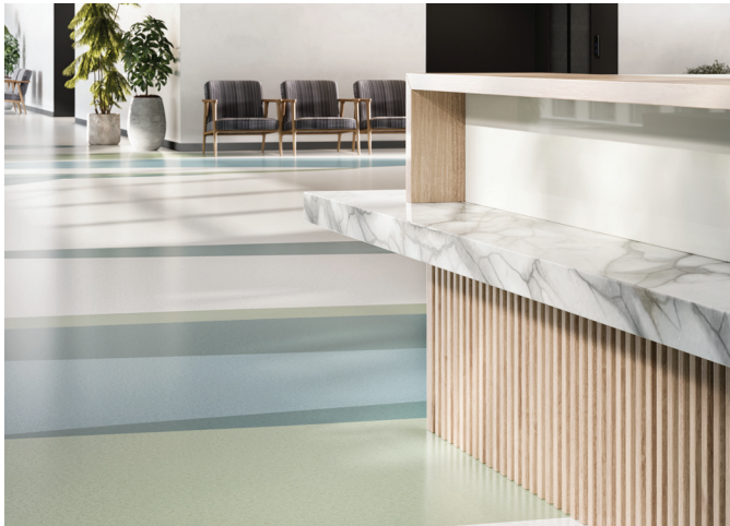
iQ Granit Acoustic 160 Light Grey, 370 Aqua, 369 Light Aqua, 412 Olive

Granit Safe.T is a durable flooring solution for heavy-traffic and wet areas where slip-and-fall accidents are a concern. The additional traction provides a confident grip in lobbies and for bare feet around patient showers. With a protective finish, the surface is safe from stains and is easy to maintain.