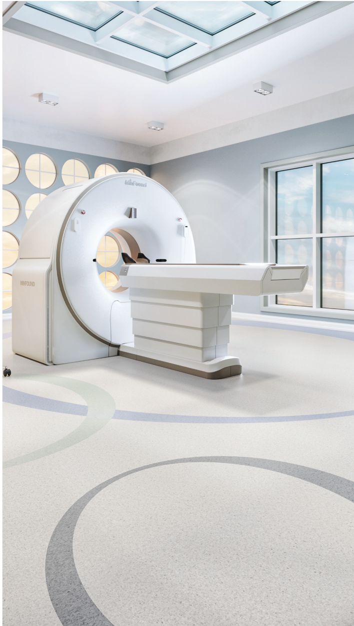
iQ Granit SD 395 Light Grey, 475 White Green, 476 Light Blue, 949 Dark Grey